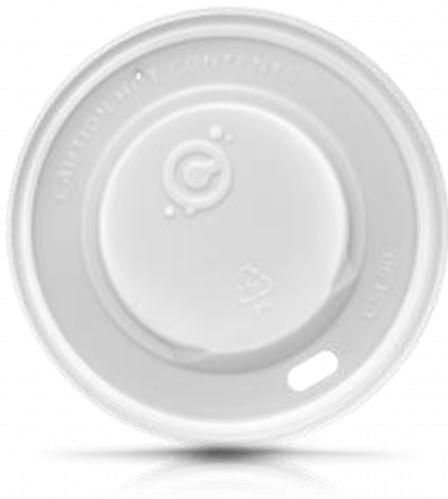
White Sip Thru Dome Lid

PrintedCups have a range of lids to fit the cups. These are the dome sip thru type. They are designed to not drip even when multiple removals and fittings have taken place.