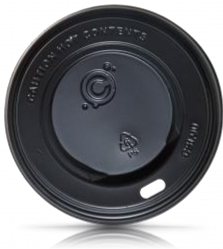
Black Sip Thru Dome Lid